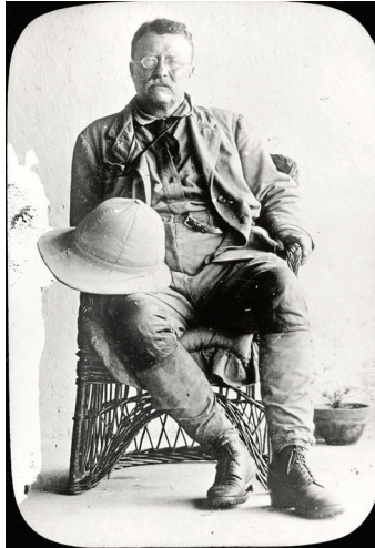
Figure 2 Theodore Roosevelt dressed in expedition attire, 1909.

1923, and from 1899 to 1910 he was president of the Washington Academy of Sciences. He published at least two articles in this journal when it was still called Proceedings : one in the first issue (1900), the other in volume 7 (1905). [7]