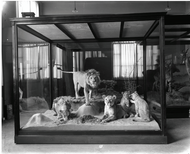
Figure 4 In April of 1913, Atlas Lions from the Theodore Roosevelt African Expedition are placed on display in an exhibit in the new National Museum of Natural History

The huge amount of correspondence between Roosevelt and the Smithsonian Institution (through various representatives, from Secretary Walcott to the taxidermist in charge of the treatment of the animals collected) exchanged before, during, and after the expedition, tells us a lot about the preparation and the planning of this safari. It also supplies us with precise information on the African species captured alive for the National Zoo (founded in 1891), on the methods of conservation of the skins, on the preservation of the animals and the many plants collected, and even on how to ship and care for the live animals.