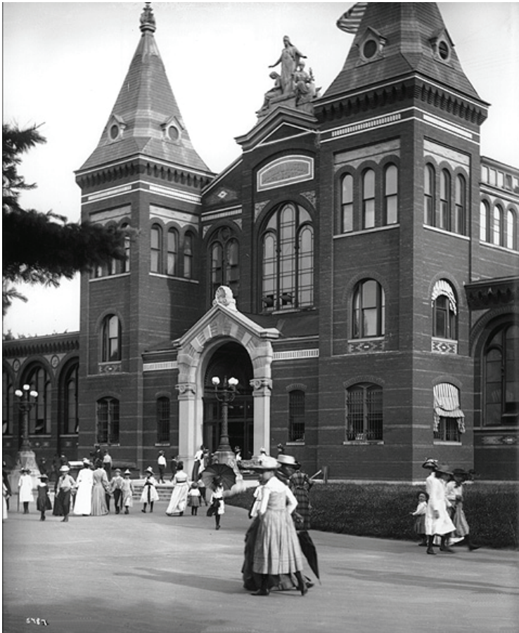
Figure 1 Visitors outside the U.S. National Museum, now the Arts & Industry Building, c. 1900

in Chicago, the Metropolitan Museum of Art in New York, and the National Geographic Society. As the collections grew, the Smithsonian borders expanded accordingly: the object of the expeditions became the exotic and at that time almost unknown parts of the world, such as Africa, Australia, Brazil, China, the Galapagos Islands, Mongolia, Papua New Guinea, Siberia, and Venezuela, to name but a few. Each time, the U.S. National Museum acquired huge amounts of artifacts and specimens, all of which greatly helped to strengthen the collections for which the Institution is famous worldwide. In some instances, the Museum would receive, in exchange for lending its scientists to analyze and identify the species, half of the specimens brought back from an expedition. This allowed deeper knowledge in all branches of natural history, besides building good relationships and partnership with the governments of other countries. [6]